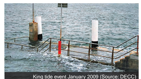
King tide event January 2009

The changes may affect the score of some projects already entered in BASIX and projects may need to be reassessed under the upgraded tool. Visit the BASIX website for more information.