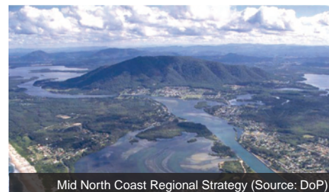
Mid North Coast Regional Strategy

The Strategy will guide local planning in the Clarence Valley, Coffs Harbour, Bellingen, Nambucca, Kempsey, Port Macquarie-Hastings, Greater Taree and Great Lakes local government areas and will be reviewed every five years.