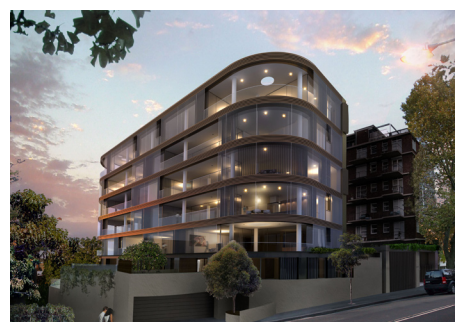
10 Wylde Street, Potts Point

The approval benefited from an additional 10% of height above the maximum permissible height control (in accordance with Clause 10 in the Sydney LEP). Recent news about the building includes the record breaking sale of the penthouse unit for $20 million.