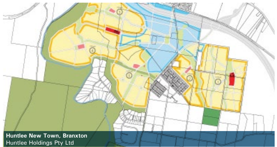
Huntlee New Town, Branxton Huntlee Holdings Pty Ltd