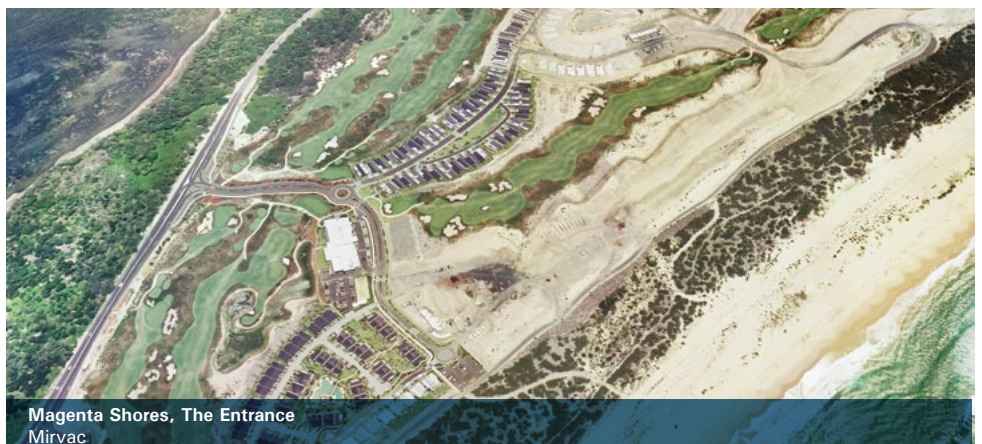
Magenta Shores, The Entrance Mircvac