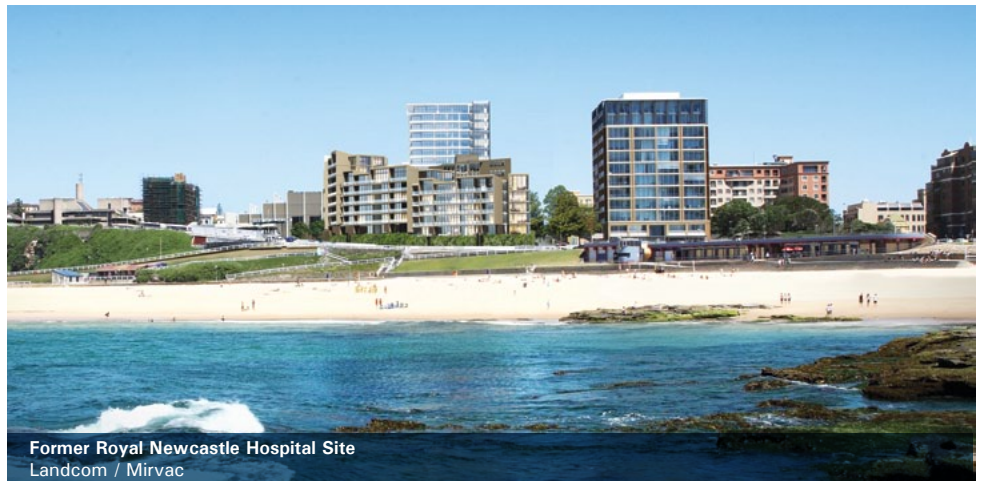
Former Royal Newcastle Hospital Site Landcom / Mirvac